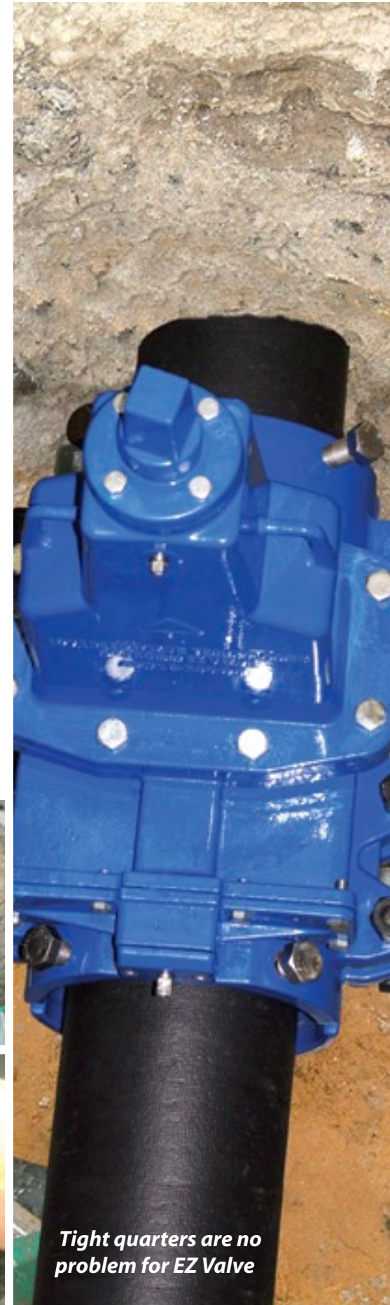
Tight quarters are no problem for EZ Valve